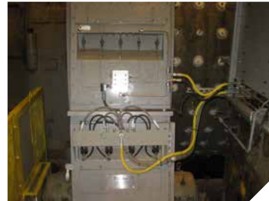
An infrared thermography system tracks the readings continuously