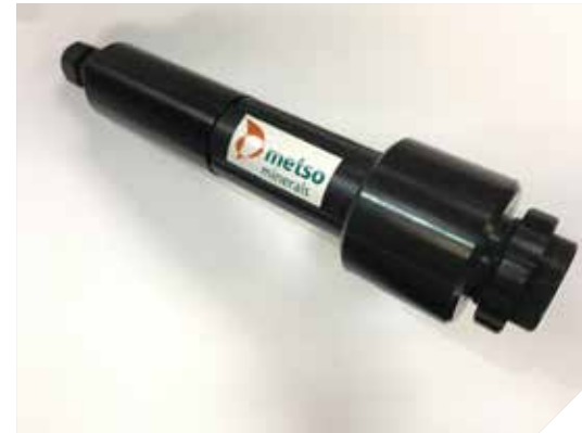
Temperature readings are taken by non-contact infrared sensors