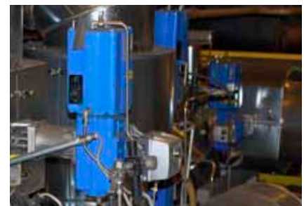
Operating in the 450°C heat, the combustion air valves are required to be durable.

The fuel for the pusher-type furnace used in heating the crude steel is coke gas, which is generated as a bi-product at the coking plant located nearby. The coke itself, which is produced from coal, is used as a material for charging the steelworks' blast furnace. Metso's valve delivery was destined for the furnace's coke gas piping, for the burners,