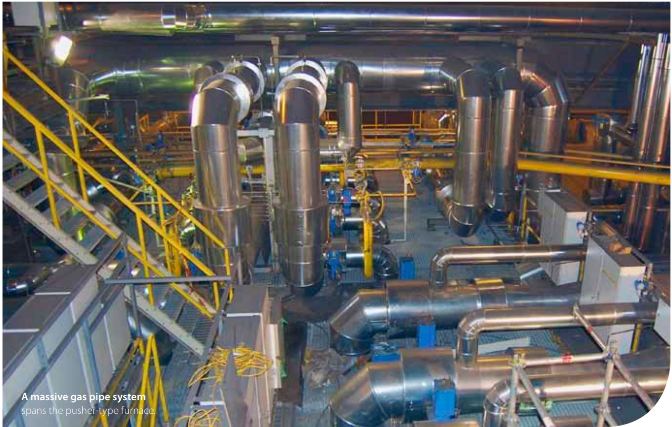
A massive gas pipe system spans the pusher-type furnace.