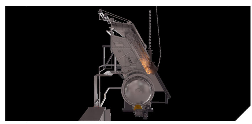
Process gas and ingress air flows during blowing