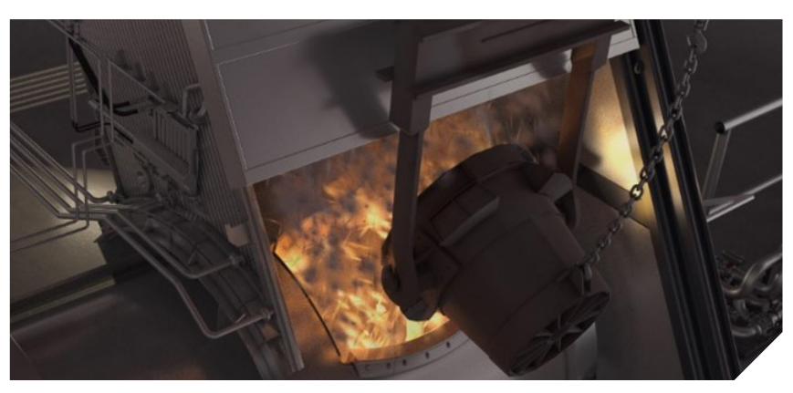
Excellent gas capturing during charging of matte