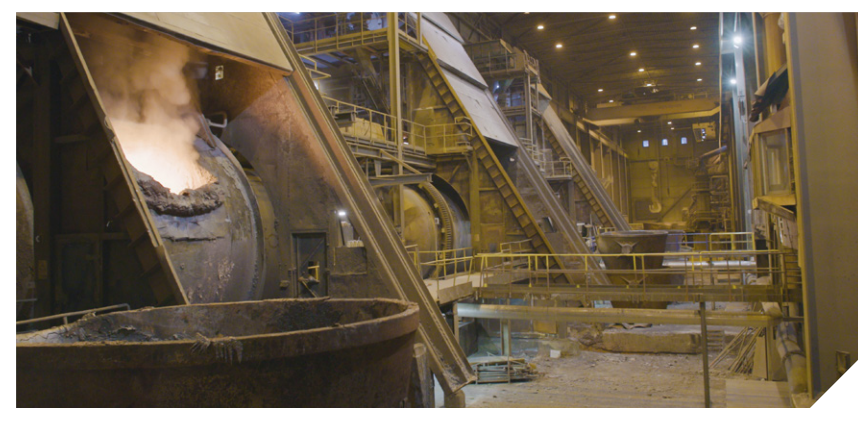
The Metso Outotec Converter Hood System installed at Boliden Rönnskär Smelter

See how the Metso Outotec Converter Hood System can optimize your operations.