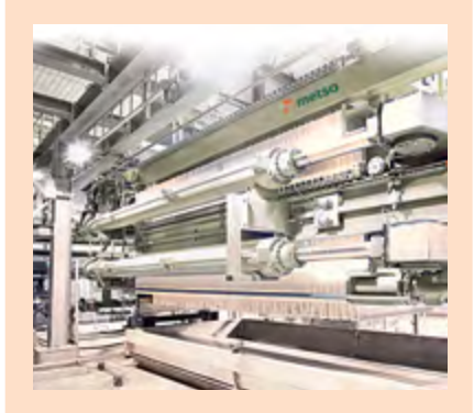
We create the technology and services required to meet our customer needs